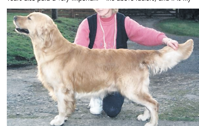
Ch Stanroph Sailor Boy (Ch Meant To Be at Moorquest ex Stanroph Shere Fantasy).