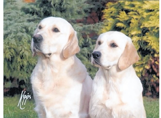
Sh Ch Stanroph So It Had To Be (Sh Ch Elswood The Highlander ex Sh Ch Stanroph So Be It) and the most recent titleholder Sh Ch Stanroph So Let It Be (Sh Ch Goldenquest Ambassador ex Sh Ch Stanroph So Be It) as youngsters.

Even when she was outcrossed, her virtues came through, the sign of a quality brood bitch. This combination cemented my breeding line and I owe most of the successes to these bitches. I have a great strength in my bitch line, due to the above factors, and it is my