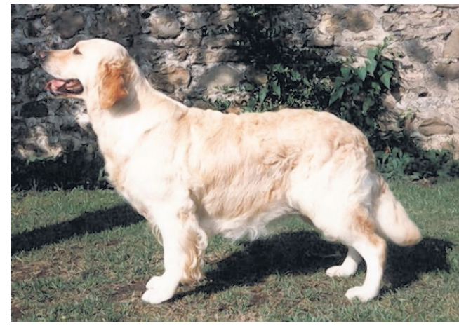
Above: Stanroph Silent Tears (Gaineda Chica Beau of Stanroph ex Clevarly Claire of Stanroph).

Left: Stanroph Shere Fantasy (Rossbourne Trooper ex Stanroph Silent Tears), CC winner and like her dam a great brood bitch. She is pictured aged 11 winning the veteran class at Crufts.